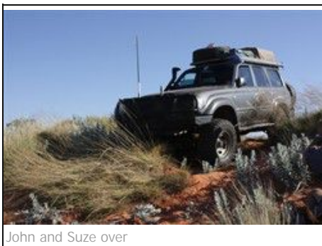
John and Suze over

Leaving this isolated spot in the morning we all headed south again along the line, once again facing the massive dunes and the ill defined line before cutting the McLarty Track where we had lunch. After some searching in the vicinity the McLarty Number 1 drill site was found indicated by a marked steel plate. We couldn't find the actual bore hole – it was probably buried in the vicinity of the sign. Now we headed west until we came across another shotline which headed south. This was the line that the two in our current group has used last year to reach the soak – we followed it.