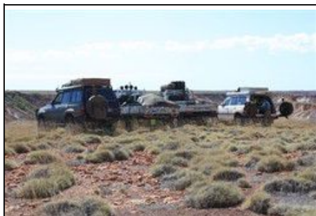
Overlooking the Canyon

Acacia was the main culprit. Sometimes we drove adjacent to the track as it was easier than the track. We camped in an old gravel pit which was near the most southern point that this track lies, before it swings around the eastern side of the ranges and heads north. Everyone attended to chores like fitting radiator protection and getting the right tyres on for the predicted upcoming desert onslaught. The dog slept most of the time at camp – most out of character.