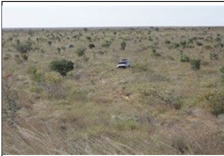
Traversing the sandy shotline