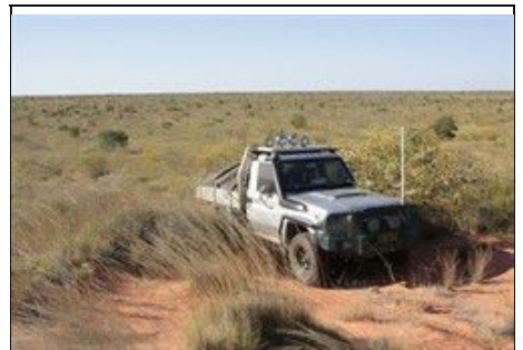
Pete on top of dune