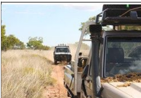
Traversing the track