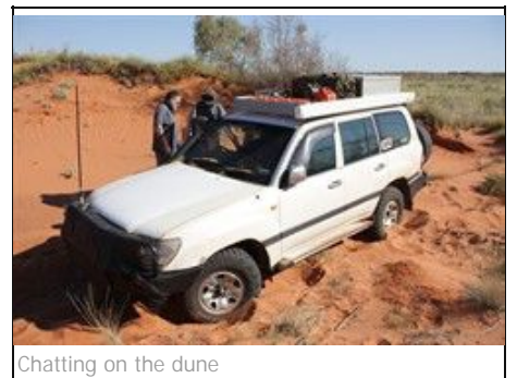
Chatting on the dune

The track wasn't too bad and the faint indications of last year's party were visible. The McLarty Hills were now visible to the south west and when the highest point was due west we cut in to visit them and probably find a place to camp. The run in wasn't too bad as we were in a dune corridor and the vegetation, apart from the usual spinifex was very sparse. Nearer to the hills it got very rocky and we had to straddle around rocky drop offs to make progress. We managed to get the vehicles close to the highest point of the hills and then walked to the summit. We then all explored the general area, which was made up of many small dome shaped hills before finding a sandy patch amongst the hills where we camped.