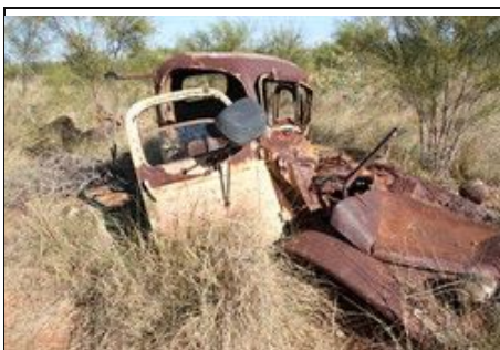
Old Wreck En Route