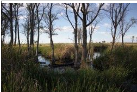
Dragon Tree Soak