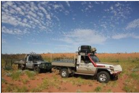
The Utes along Whithorn Way