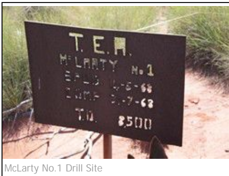
McLarty No.1 Drill Site

Leaving this isolated spot in the morning we all headed south again along the line, once again facing the massive dunes and the ill defined line before cutting the McLarty Track where we had lunch. After some searching in the vicinity the McLarty Number 1 drill site was found indicated by a marked steel plate. We couldn't find the actual bore hole – it was probably buried in the vicinity of the sign. Now we headed west until we came across another shotline which headed south. This was the line that the two in our current group has used last year to reach the soak – we followed it.