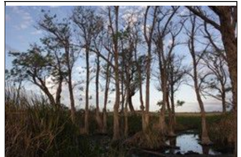
Dragon Tree Soak

The soak is truly an oasis, with plenty of water in it – A journey to it is not to be taken lightly, as it is a rarely visited place, and it has taken us a full five days to get here from the roadhouse, and after we left the station owners did not see a single vehicle or other people at all along the way. Still it is another place now visited and I no longer have to wonder!!!!