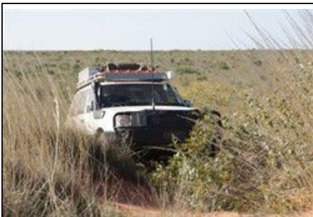
Phil coming over the top