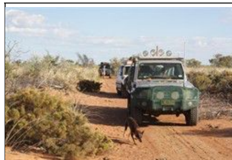
Stopped for rest

This southern track should take us around the southern end of the Edgar Range and eventually to yet another southern track to take us further to our destination. From the Outcamp the track was extremely overgrown. Flowering Acacia branches overhung the track; it was very thick in some spots. The flowers were collected in various spots on the vehicles. The track hadn't been graded for many years. I only caught a brief view of the range by standing on top of the cab. We only managed about 40 kilometres before we decided to camp, and did so, our first camp together – just off the track in the bush.