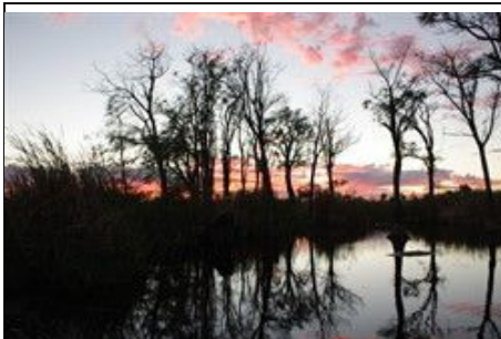
Dragon Tree Soak