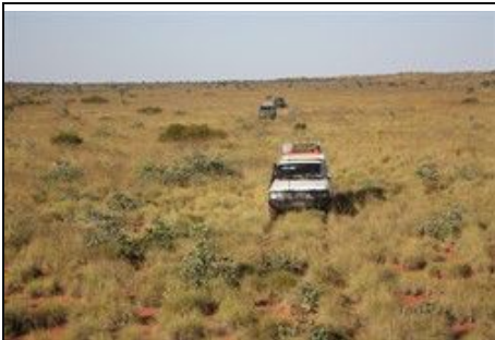
En Route to McLarty Hills