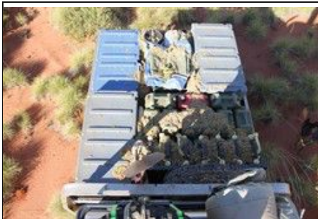
Back of Tray