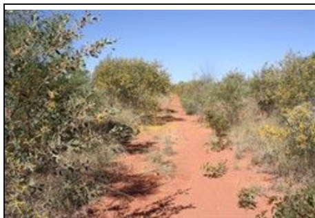
Acacia Filled Track

Twenty minutes later we arrived at the turnoff to Dampier Downs Road. This road, or sandy track more correctly would take us close to the desert. It seemed fairly under utilised for a main station access road however was easily enough traversed. We met the station owner and his son near the Dampier Downs Outcamp and after brief dialogue and directions as to the best way to access the southern track we made our way south.