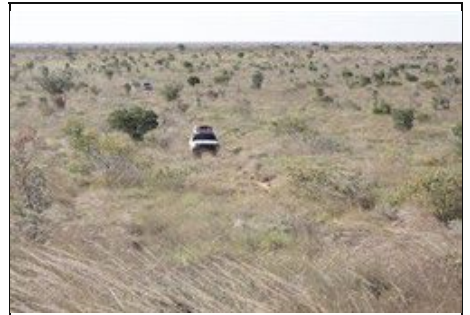
Traversing the sandy shotline