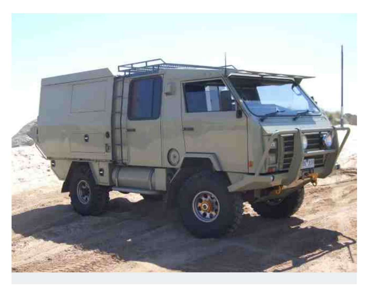
September 24, 2011 at 8:19 PM