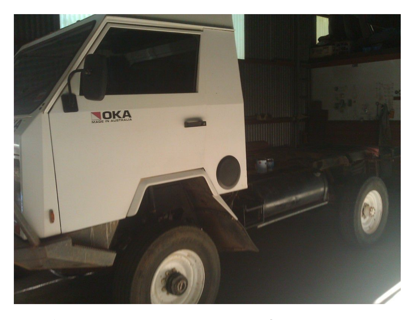
#241 is for sale as a cab-chassis and advertised on Gumtree.