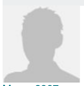
Moose2367 Member Posts: 110

Just had a look at OKA 206, in Katherine, the owner is from Hervey Bay up here working, ex RAAF fire unit he has converted into a pop top camper. Only got 122K on it, also said e was thinking of selling it but wants around $60k. Not a bad looking unit from my very limited experience.