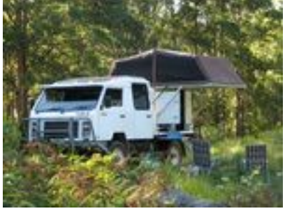
Tony Lee Member Posts: 539

Yes, I've heard that people put an electric fuel pump in to prime the system when they run out of fuel - and if you just plumb it in in series with the lift pump then if the mechanical one fails, you can just switch the priming pump on. Supposedly the mechanical one will just suck through the electric one with no problems.