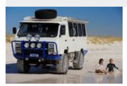
Hal Harvey Site Owner